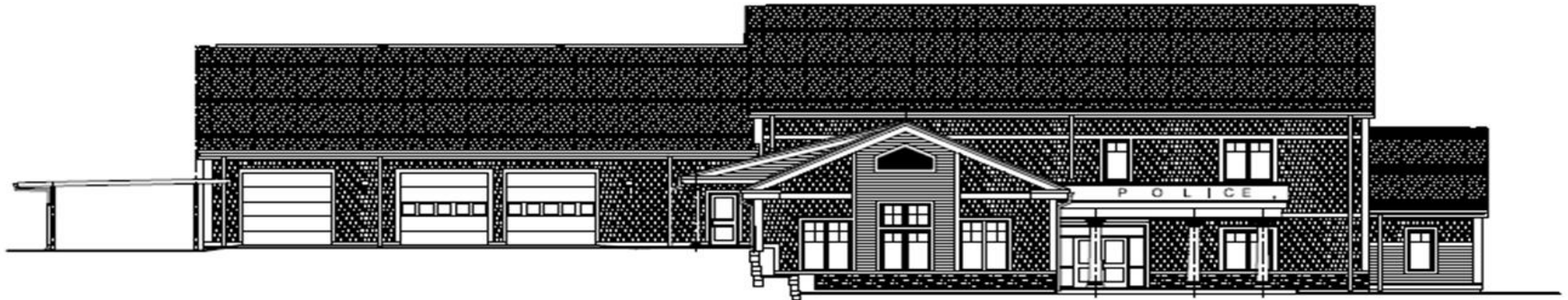
View from front of building