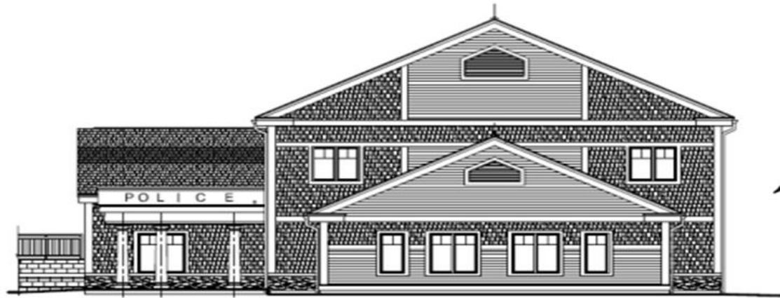
View from Route 12