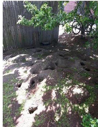
Rat Burrows in Yard