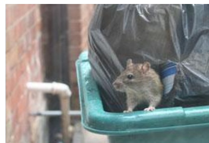
Rat in trash barrel with no lid and exposed trash bag