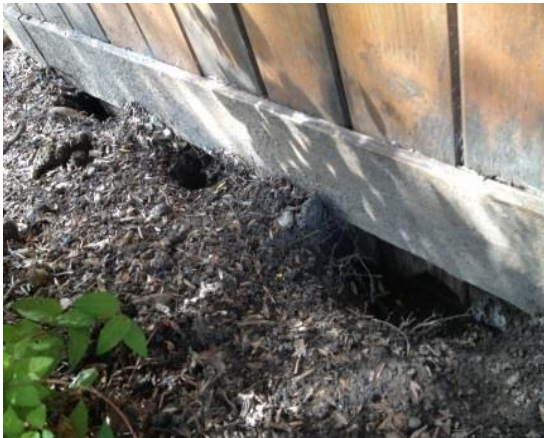
Rat Burrows beneath structures