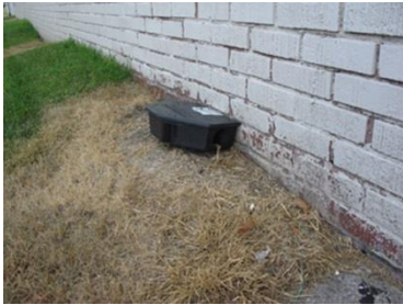
Bait Box along exterior wall