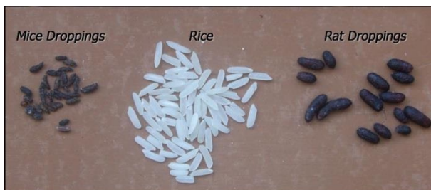
Mouse vs. Rat droppings